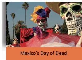
Mexico's Day of Dead