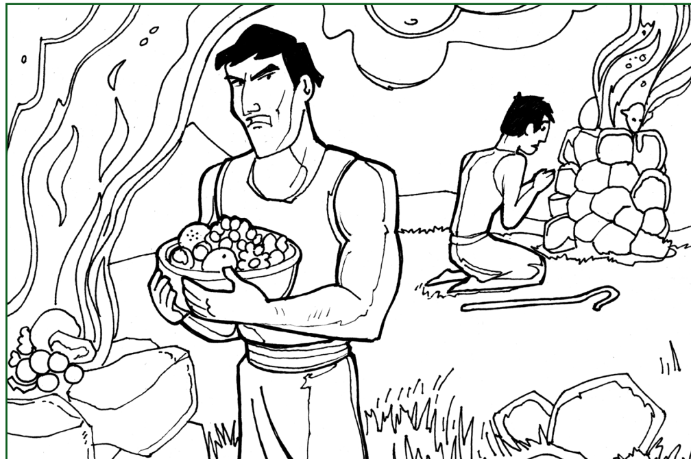
Cain and Abel