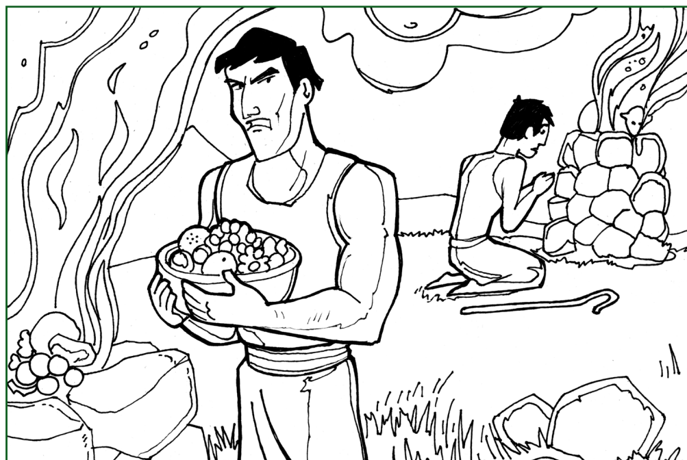
Cain and Abel